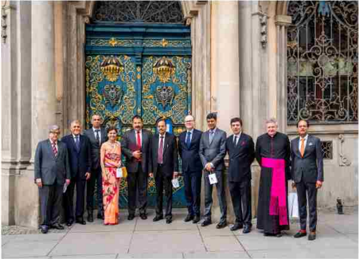
Signing of Visitors Book at the University of Wroclaw