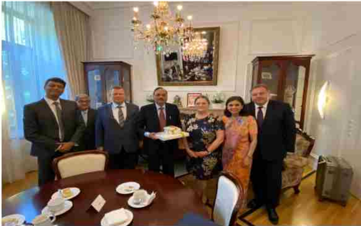
At the Constitutional Tribunal of the Supreme Court of Poland