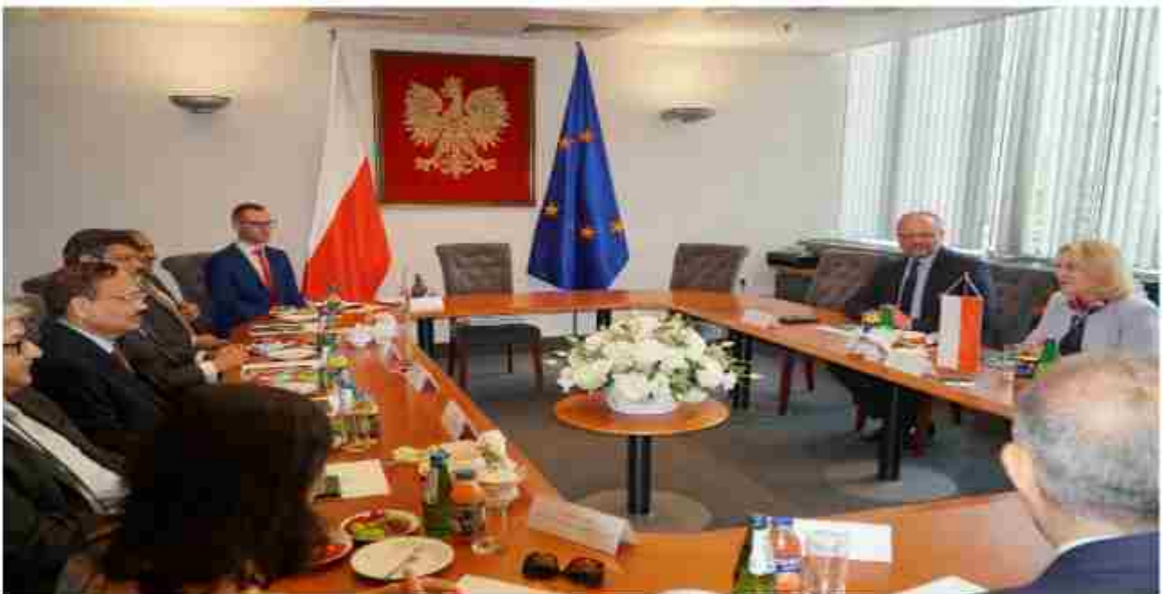
Meeting at the Supreme Court of Poland