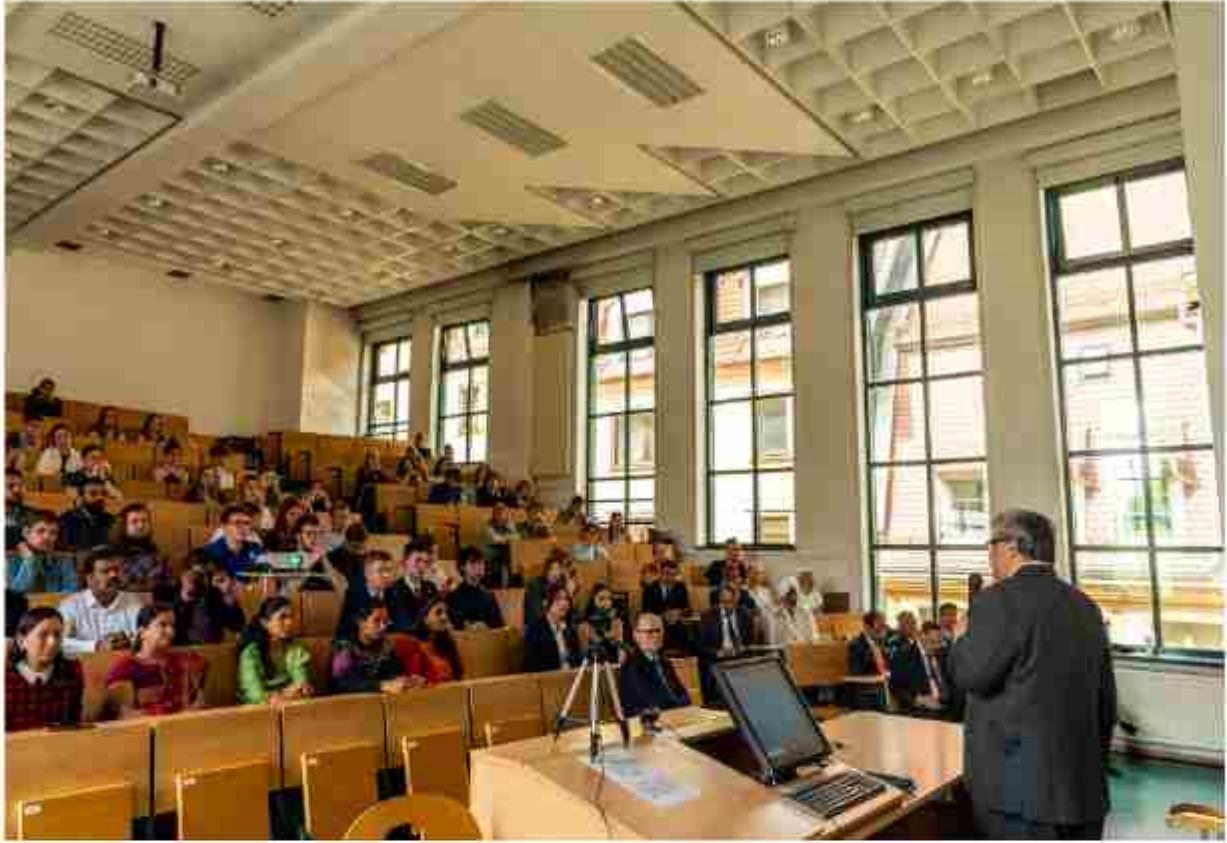
At the University of Wrocław